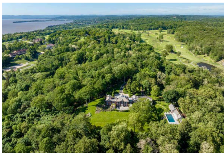
The estate is 22 acres in Briarcliff Manor. A 100-foot-long stone terrace looks onto the nearby Hudson River.