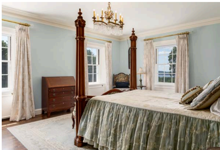
The main house has seven bedrooms.