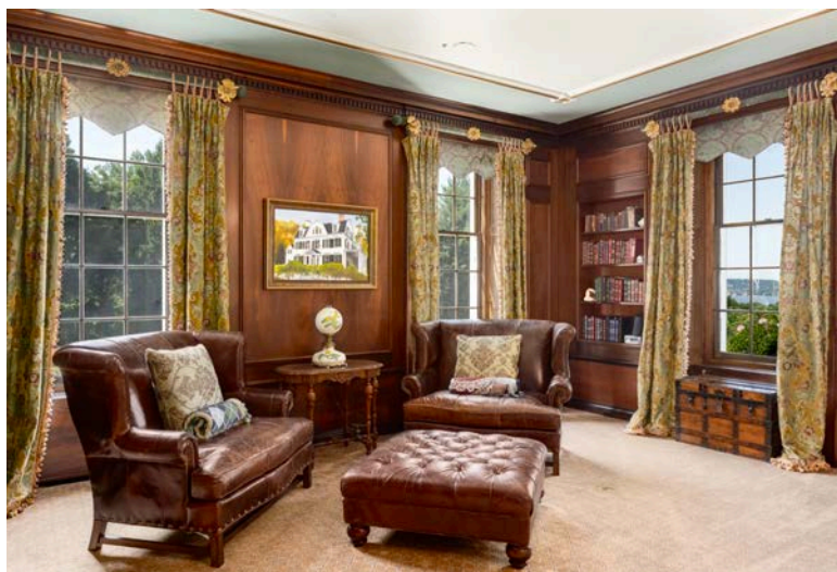
The house has a walnut-paneled library.

Located in Briarcliff Manor, the red-brick main house spans about 13,000 square feet with seven bedrooms. With panoramic Hudson River views, the property also contains a pool and poolhouse.