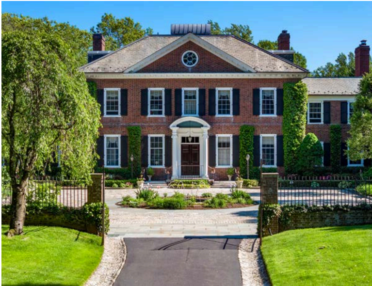
Schmidt designed the red brick house to have two symmetrical wings. The driveway is framed by specimen trees.

To thank the couple, the producers of the show gave the Hayneses a cameo. They appear in the background of a party scene in the first episode. They also got to meet De Niro and other cast members and crew. In the show, De Niro's character is seen swimming in the pool and jogging around the woodlands on the property.