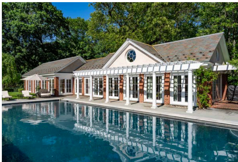
The property has a pool and poolhouse.